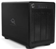
OWC ThunderBay 4