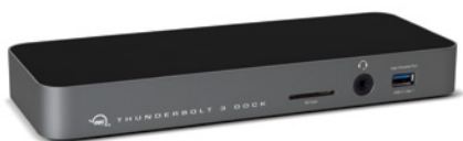
OWC Thunderbolt 3 Dock *