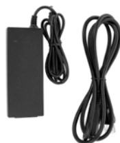
Power supply and cable