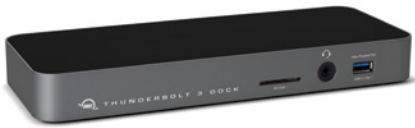
OWC Thunderbolt 3 Dock *