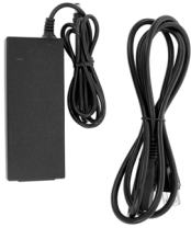
Power supply and cable