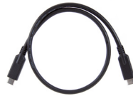
USB 3.1 Gen 1 Type-C cable

* Space Gray model shown, requirements and usage details identical for all models.